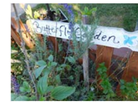
Butterfly Garden in Infant/Toddler yard

Imaginative play has been an activity the children frequently initiate with volunteers. A game the students have been playing recently is pretending to serve food, like ice cream. This pretend play could be steered in a different fashion to focus on the garden, of which an example could be "what type of fairy are you and what type of plant do you live under?"