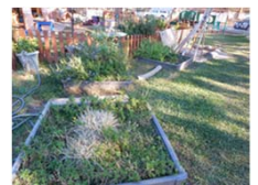
Plots available in the Infant/Toddler yard