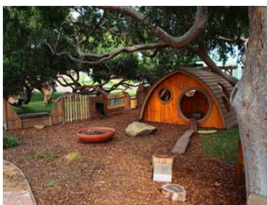
Example of Warden's concept of outdoor space at the Orfalea Family Children's Center

Outdoor space works most effectively when it has materials in it that are designed to be outside, with use of natural loose materials like sand, stone, rock, sticks, and leaves. Other examples of outdoors stated in Learning With Nature include kitchen gardens, the physical community of schools, and community spaces.