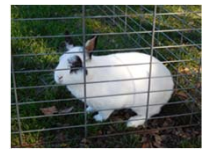
Bunny in Infant/Toddler Yard

The children also frequently sit with teachers in the little reading circle outside under the tree. There is a book about animals that the children often pick out to read. The volunteers have been actively relating the readings to the children's surroundings. One creature featured in the book is the stick bug. On one occasion when reading this book, the teachers discussed how the insect was camouflaged to look like a stick. The children then collected sticks to compare to the picture of the insect. Looking for birds in the trees and talking about the horses near the center are also topics discussed after reading the animal book and seeing these creatures on the pages. There is a bunny that a teacher brings to the yard as well, and the children frequently run up to the bunny to pet its ears and watch it hop.