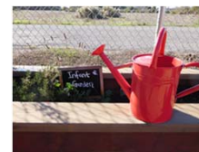
The Infant/Toddler Plot in the large garden